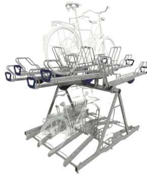
SINGLE- AND DOUBLE-SIDED