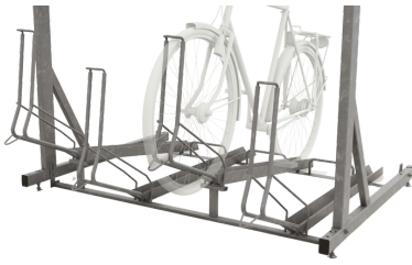
HYPER STABLE WHEEL HOLDER